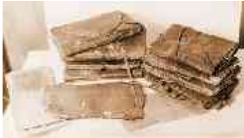
Nag Hammadi Library

What do we do with the difficult bits? Valentinus' solution – myth and secret knowledge.